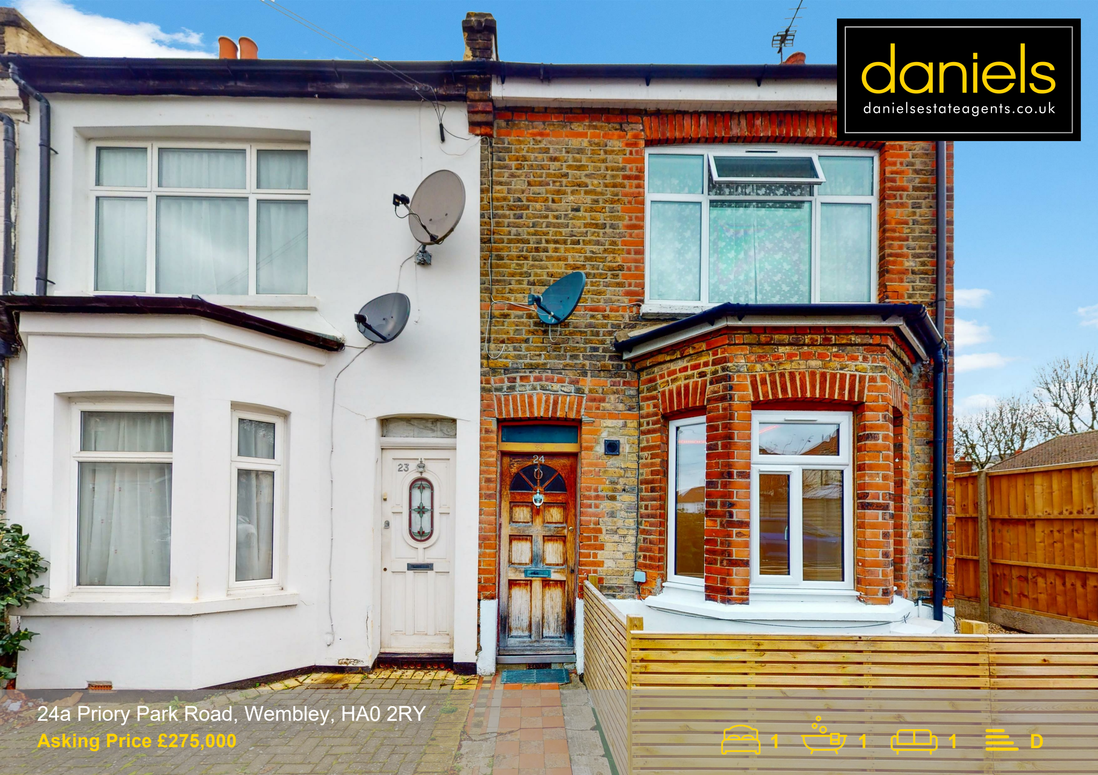
24a Priory Park Road, Wembley, HA0 2RY Asking Price £275,000